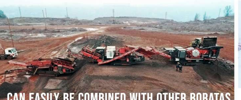
CAN EASILY BE COMBINED WITH OTHER BORATAS MOBILE MACHINES AS TANDEM WORKING.