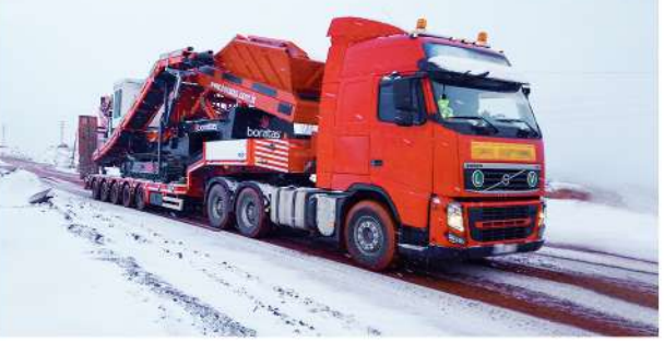
EASY TO TRANSPORT DUE TO FOLDABALITY BUILT FOR HARSH SITUATIONS INCLUDING EXTREME WEATHER CONDITIONS